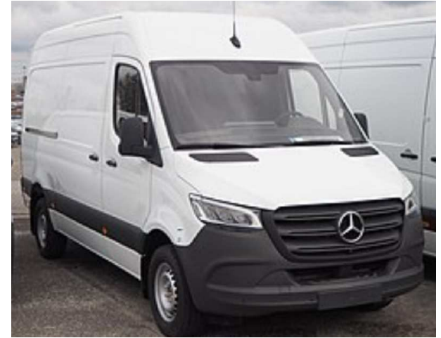
MB SPRINTER 907